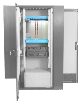
Deployment in street cabinets