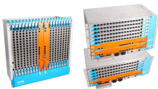
SI3000 Lumia in 20-, 10-, and 6-slot chassis