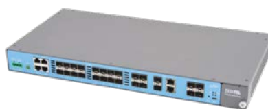
SI3000 Lumia G16, compact 1U OLT